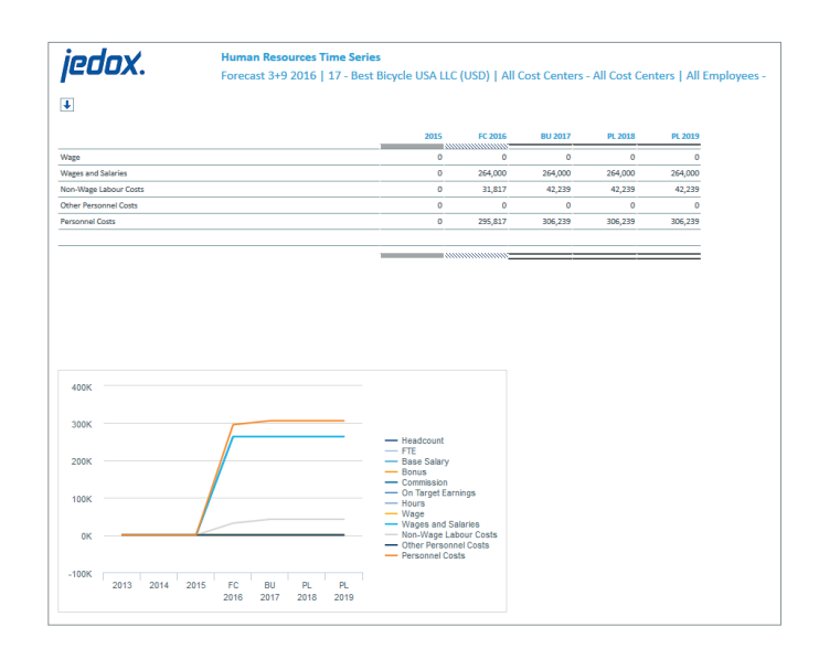
Figure 1: Reporting your HR data has never been easier The Jedox HR Model helps you optimize your workforce structures, costs and productivity.

Use the Jedox Model to plan and analyze your HR investments in line with business strategy. Simplify the tasks of planning, analyzing and reporting personnel data. Use its rich, built-in functionality to analyze actuals and collect budget data through intuitive data entry screens. Forecast your future headcount requirements and develop the right recruitment and loyalty programs to drive your business ahead.