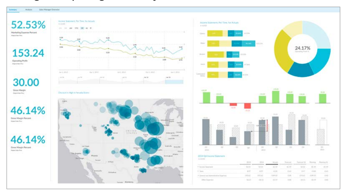
Figure 2: Examining and Improving Profitability

A Nucleus Research note of October 2015 reports the ongoing benefits of SAP Analytics Cloud: "The offering provides users with a faster time to analysis by supporting a single repository of analytics tools."